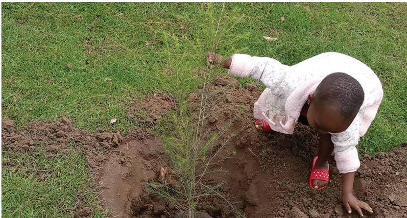
A child plants a tree at the MMS health center in Rubanda, Uganda.