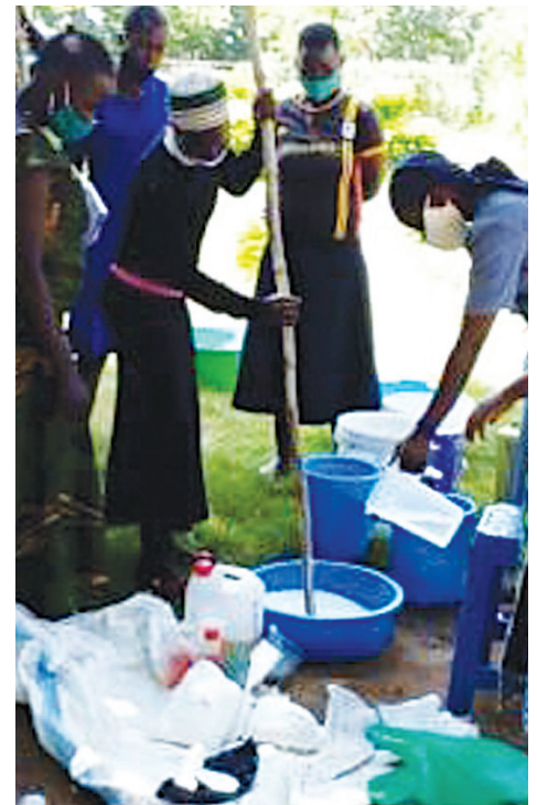
MMS teach women from different settlements how to make soap to share with those who can't afford to buy hand soap.