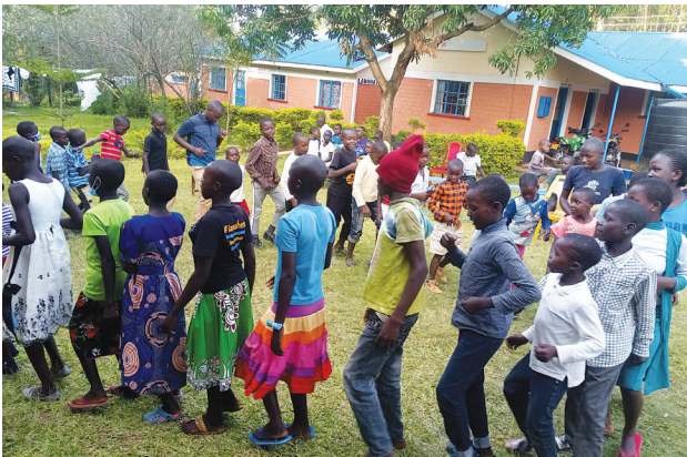
Pediatric patients enjoy a week-long camp provided by MMS at the Health Centre.

Patients coming to the Good Shepherd Health Centre in Angi'ya/Rongo, Kenya, sometimes offer sweet potatoes, groundnuts or beans as payment for services. Bartering goods for services is not a surprise to the Medical Mission Sisters running the Centre. MMS discerned ministry in this remote location precisely to be a healing presence with those who live on the margin.