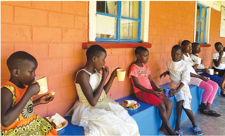
Children enjoy eating their lunch during camp at the Good Shepherd Health Centre.

In 2021 Medical Mission Sisters' formation community in Nairobi received their largest group of first year novices ever: ten new women joined the five who were starting their second year. The welcoming celebration was a rich tapestry of color and meaning as the women's cultures from Ghana, Malawi, Kenya and Uganda were woven into the prayers and rituals.